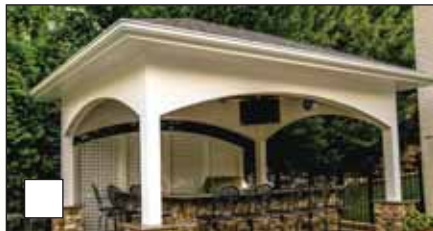
PAVILIONS & GAZEBOS