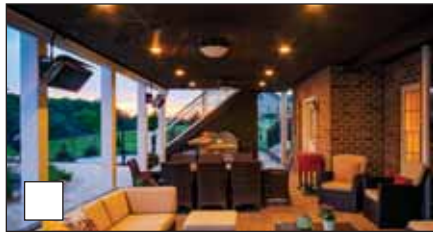
UNDER DECK GUTTER SYSTEMS