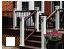
VINYL – Metal Balusters – Vinyl Balusters