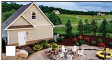
GARAGE/POOL HOUSE COMBO