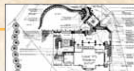
B&W PLAN VIEW

We find that some clients are more comfortable with reading plans than others. Our state-of-the-art technology allows us to offer three distinctly different visual options at certain price points so that we can help you to visualize your project before any significant installation investment. Our design options are shown at right.