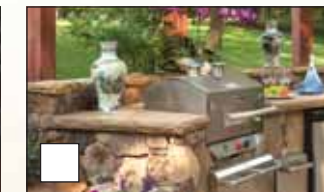
SANDSTONE Price Point 3 + Easy to clean - Requires sealing every 2-3 years - Will stain (lightly)