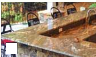
GRANITE Price Point 1 + Easy to clean + Smooth surface + Weathers well