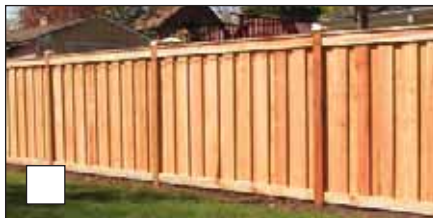
BOARD ON BOARD