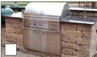
SRW BLOCK Price Point 1