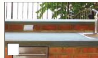
BLUESTONE Price Point 2 + Virtually indestructible - Hard to clean b/c stone is porous - Will stain