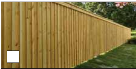
BOARD & BATTEN