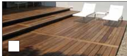
CEDAR, IPE, TEAK