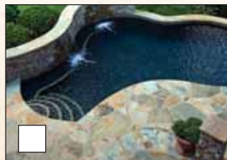
TANNING LEDGE/BUDDY SEAT