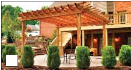
PERGOLA (WOOD OR COMPOSITE)

OVERHEAD STRUCTURE TYPES: Please check material(s) in which you may have interest: