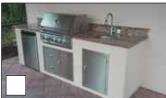
STUCCO Price Point 2