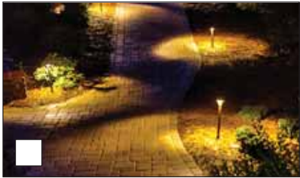
PATH LIGHT (AREA LIGHTS)

There are many fixture style and color options available. Below is a conceptual overview of those most frequently used.