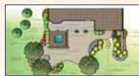
RENDERED PLAN VIEW