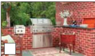
BRICK Price Point 3