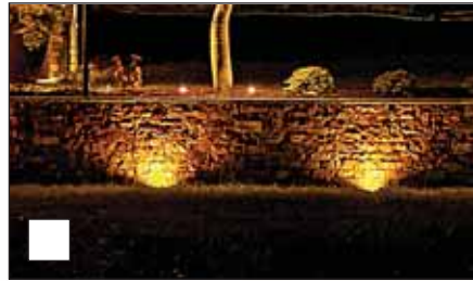
IN-GROUND WELL LIGHTS