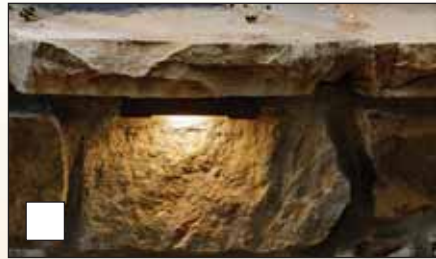
STEP OR WALL CAP LIGHT

IFYOU ARE A MUSIC LOVER, there's a good chance that an outdoor speaker system is something worth looking into. There are many different systems that may work for you. One of the most popular systems that meets the needs of many homeowners is the SONNARRAY SRI System.