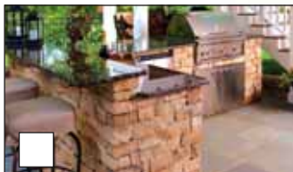
NATURAL STONE Price Point 4